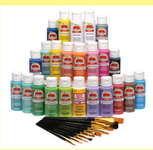
For more inspiration and education please visit plaidonline.com/letspaint

For Art Lessons, check out this kit with all the Apple Barrel acryllic paints, brushes and Mod Podge you'll need!