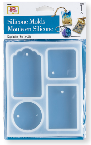
27575 Tag Keychain Mold 4" x 5" x 0.5"