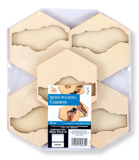
56934E River Pouring Coasters 5 piece - 4" x 4" x 0.31"