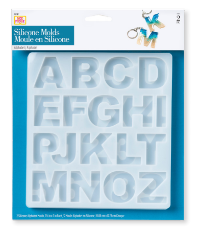
25293 Alphabet Molds Set of 2 7.5" x 7.0" x 0.25"