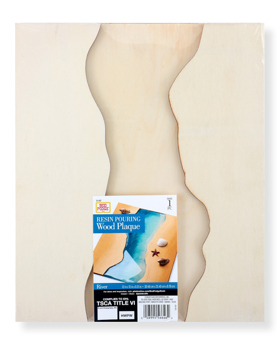
56646E River Pouring Plaque 10" x 12" x 0.31"