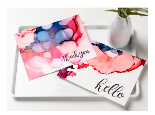
Use directly on project surface for stunning effects

Apply to resin filled molds for swirls and patterns