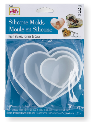
27578 Heart Molds Set of 3 Small: 1.375" x 2" x 0.5" Medium: 2.625" x 3" x 0.5" Large: 3.5" x 4" x 0.5"