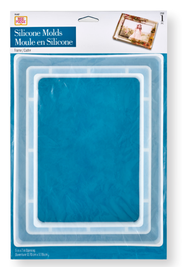
27581 Frame Mold 5" x 7" Opening