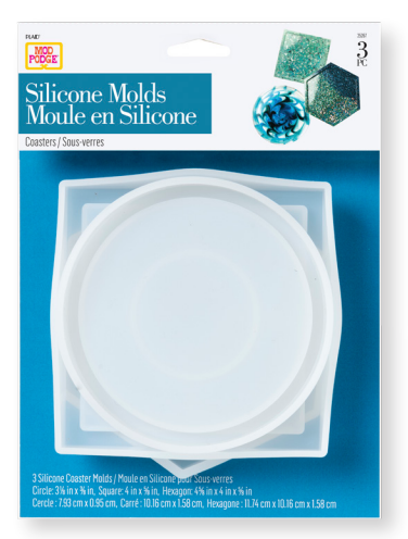
25267 Coaster Molds Set of 3 Circle: 3.12" x 0.37" Square: 4" x 0.62" Hexagon: 4.62" x 4" x 0.62"